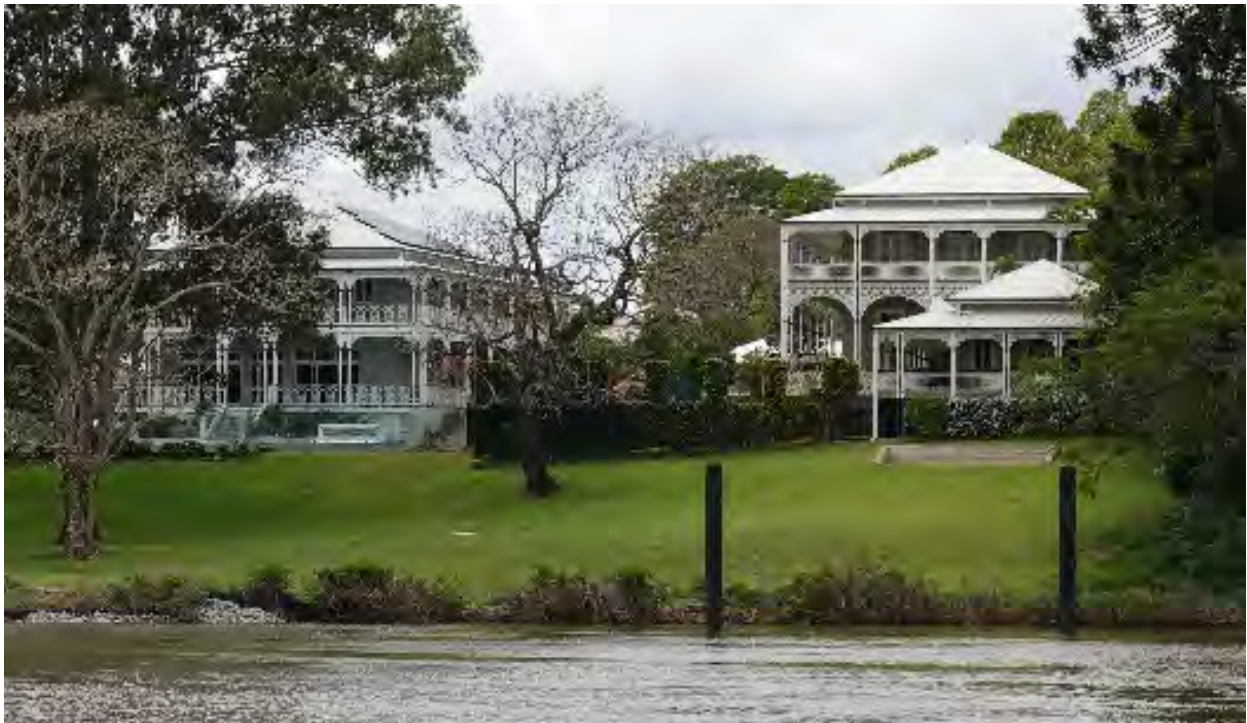
Houses along the bank.

After a leisurely start we wandered across the river to the Cultural Centre pontoon to catch the cruiser 'Miramar' for a wonderful cruise up the river, passing some of Brisbane's older and most exclusive homes.