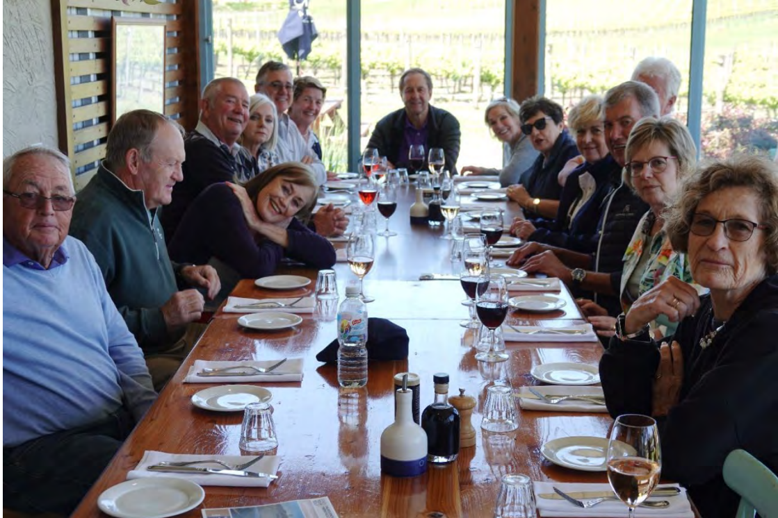
Happy faces at Soumah Vineyard

Next it was onto the wine tasting, firstly at Soumah of Yarra Valley where we also enjoyed an al fresco lunch and an opportunity to buy some of their wines.