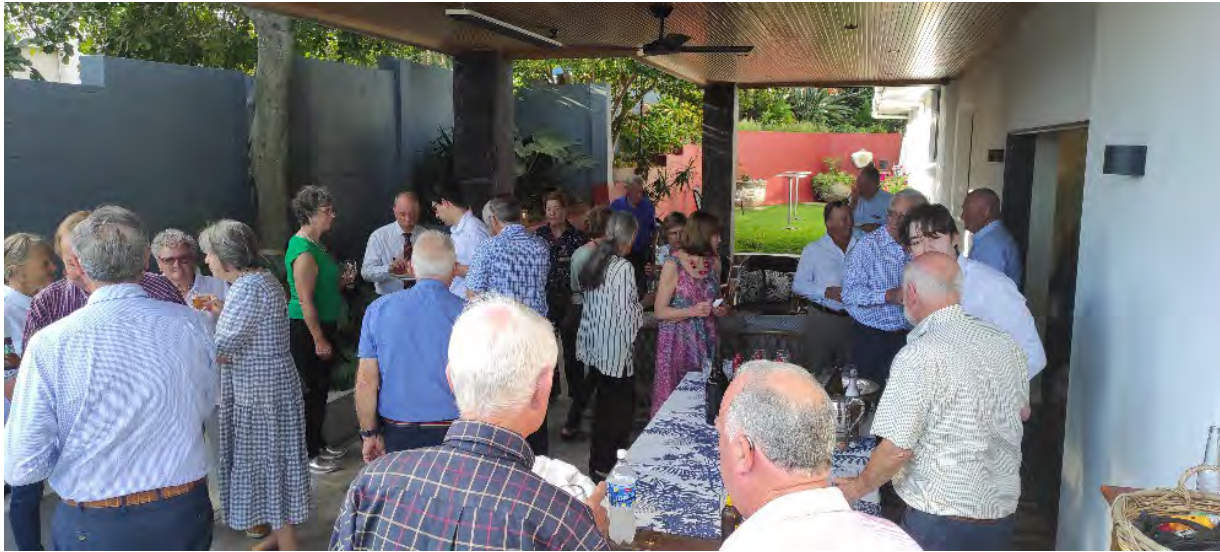
We were completely spoilt, with wonderful company and plenty of canapés and refreshments.