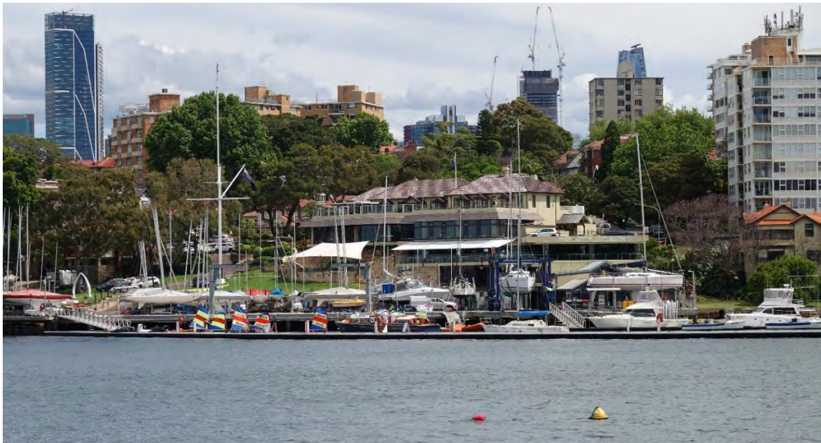
Royal Sydney Yacht Squadron

Later, we were picked up by our coach for a tour of Sydney, which was quite an eye opener, so many skyscrapers, and high-rise buildings, not only company offices, but accommodation as well, when you see the views, you can understand why everyone wants to be near the Harbour.