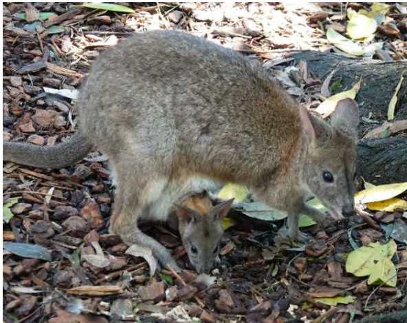
A Red-necked Pademelon and Joey

Most of the players managed to play and the Australian Seniors had arranged for the non-players to visit the Featherdale Wildlife Park a short distance away.