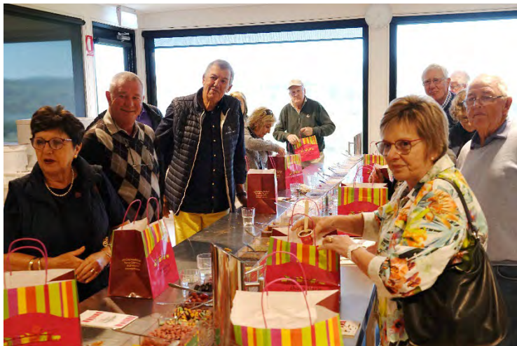
In the Rocky Road Mixing Room

Our first visit was to the Yarra Valley Chocolaterie and Ice Creamery.