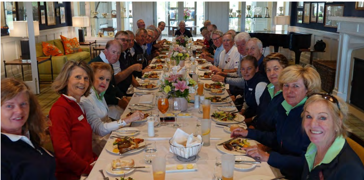
We were treated to a superb buffet lunch, which set us up for the match.