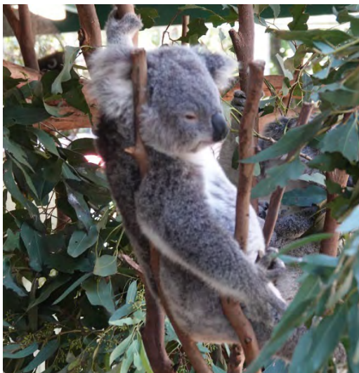
Laid back Koala