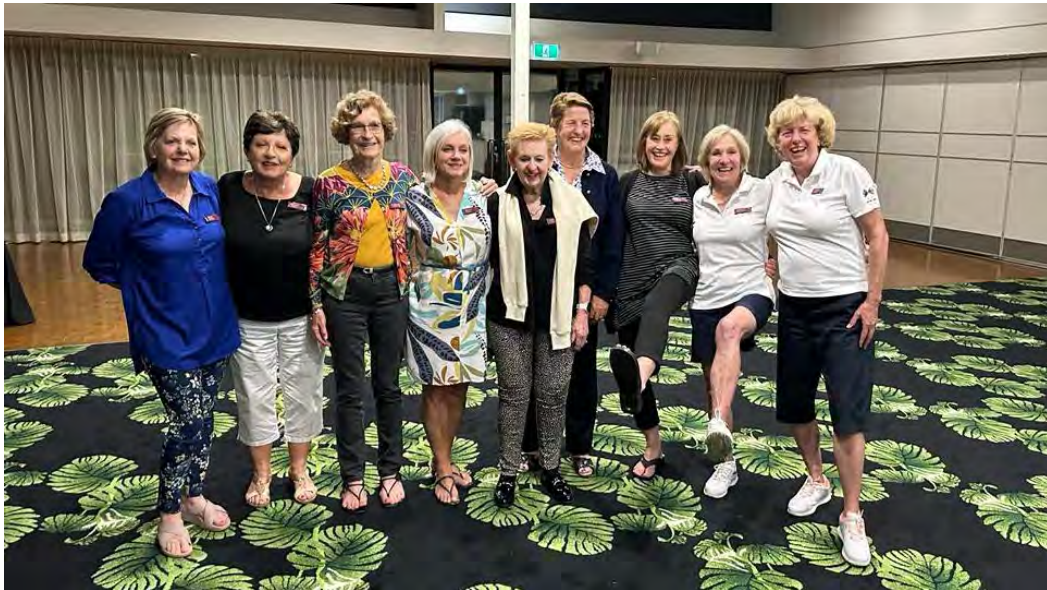
The SA Ladies