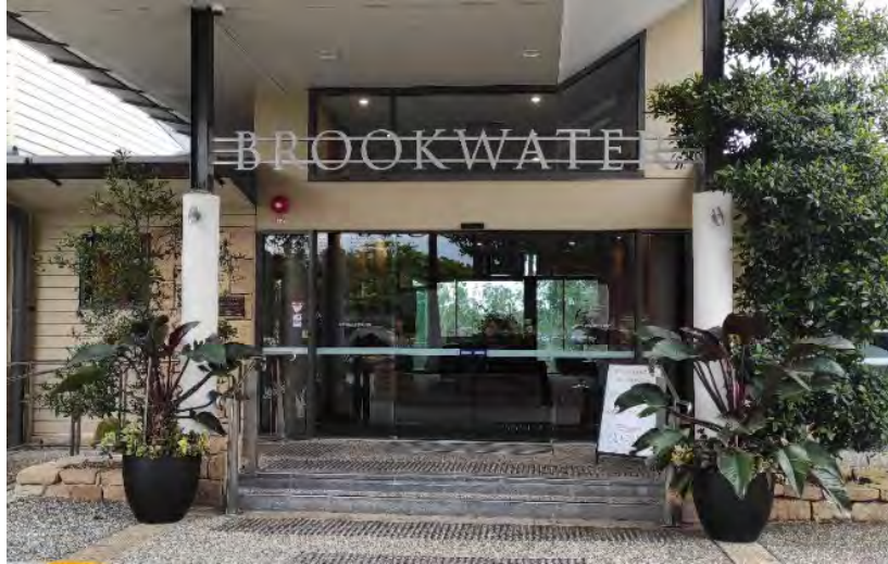
Brookwater GC Entrance.

An early start for the golfers, fortified with a good breakfast, left by coach for Brookwater Golf Club.