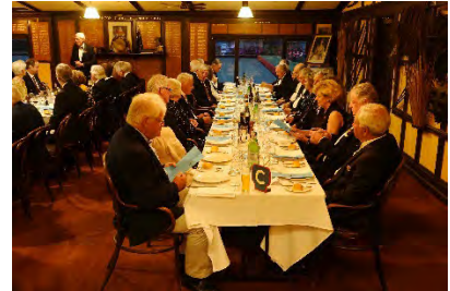
The West Brighton Club

This was a wonderful meal, worthy of such an occasion.