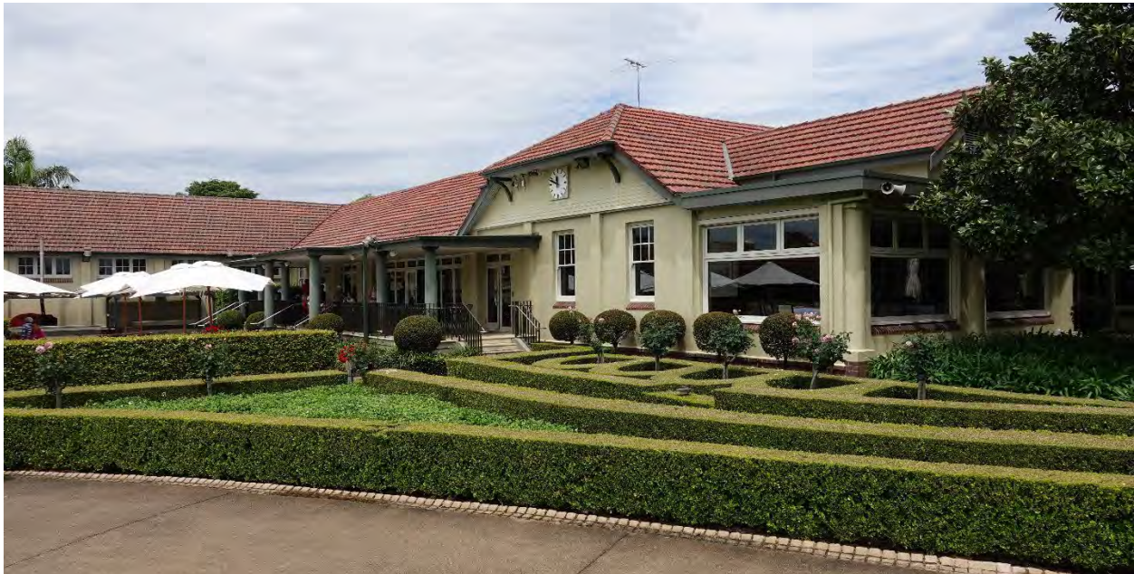
The Concord Clubhouse.

A leisurely start this morning, arriving at Concord Golf Club about 11 o'clock.