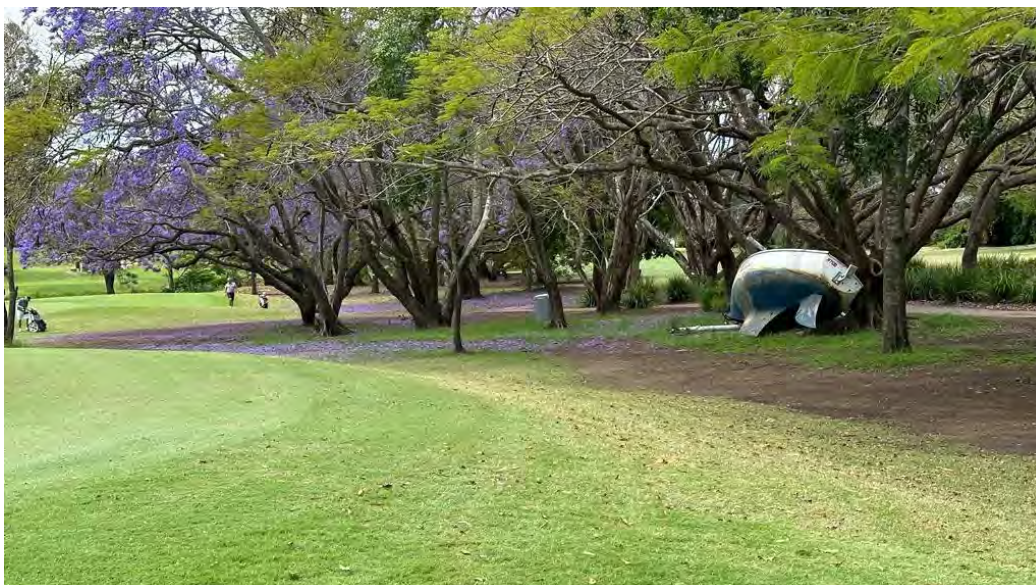
The sad end of “Miss Freelove” stranded after the March floods