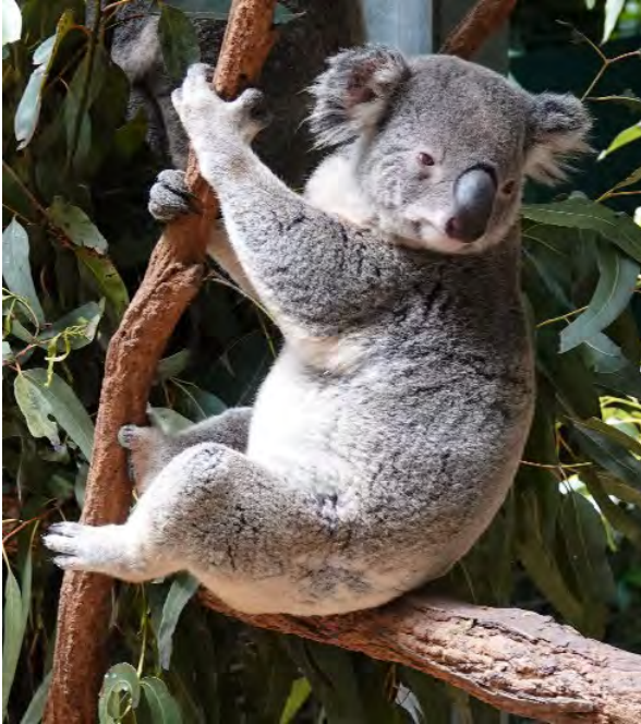
A rescued koala

We caught the cruiser for the return trip back and arrived at our hotel about 4.00pm.