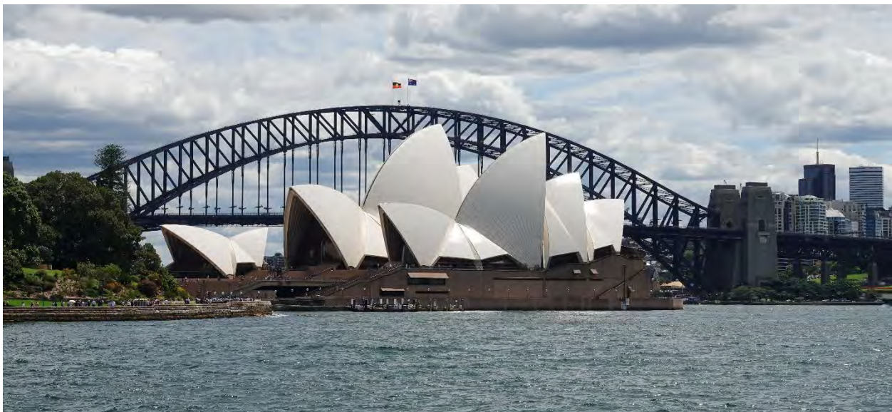
Sydney Opera House with Sydney Harbour Bridge in the background.

A free morning in Sydney, such a beautiful town with so much to enjoy. The Sydney Harbour Bridge and the Opera House so majestic in real life, they are breathtaking.