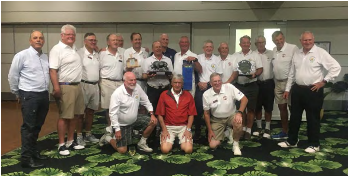
The SA team and their hosts after a day of golf