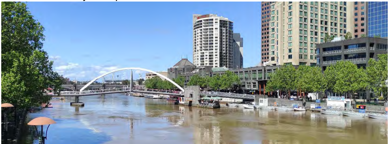
Melbourne and the Yarra river, AND Blue Sky!

Everybody was up early, to catch the bus for Brisbane Airport and our flight to Melbourne. Once we found our way to the Group Bookings counter the remainder of the journey was uneventful.