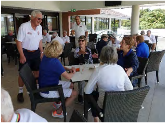
Drinks and snacks on the terrace.