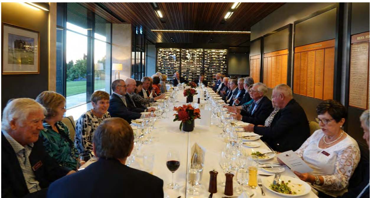
Lunch in the beautiful clubhouse that has large vistas of the course.

We were met by the Senior golfers and some wives and after a light lunch, we all teed off from 1.00pm.