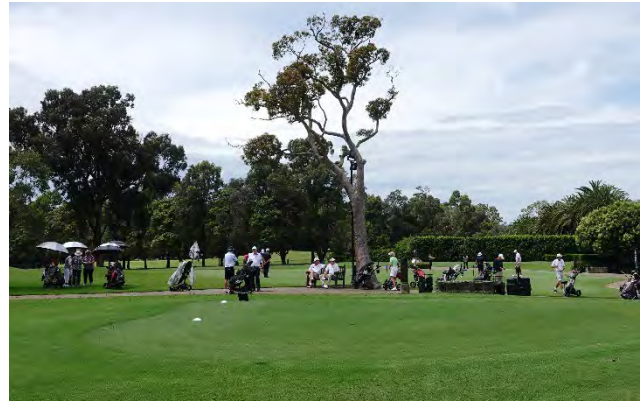
The 1 st tee at Concord GC

Most of the players managed to play and the Australian Seniors had arranged for the non-players to visit the Featherdale Wildlife Park a short distance away.