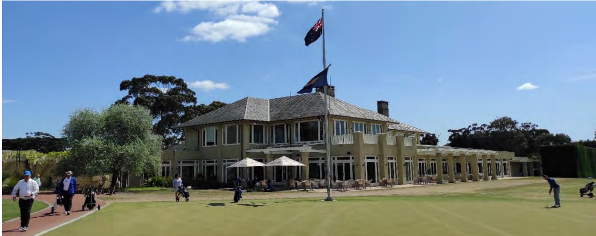
Royal Melbourne Golf Club, what a beautiful setting, stunning clubhouse, with plenty of memorabilia.

This morning we had a leisurely start, with a late breakfast before our start at 11.00am. A coach ride to Royal Melbourne Golf Club in the morning sun. The West Course is rated No.1 in Australia and in the top 5 in the World.