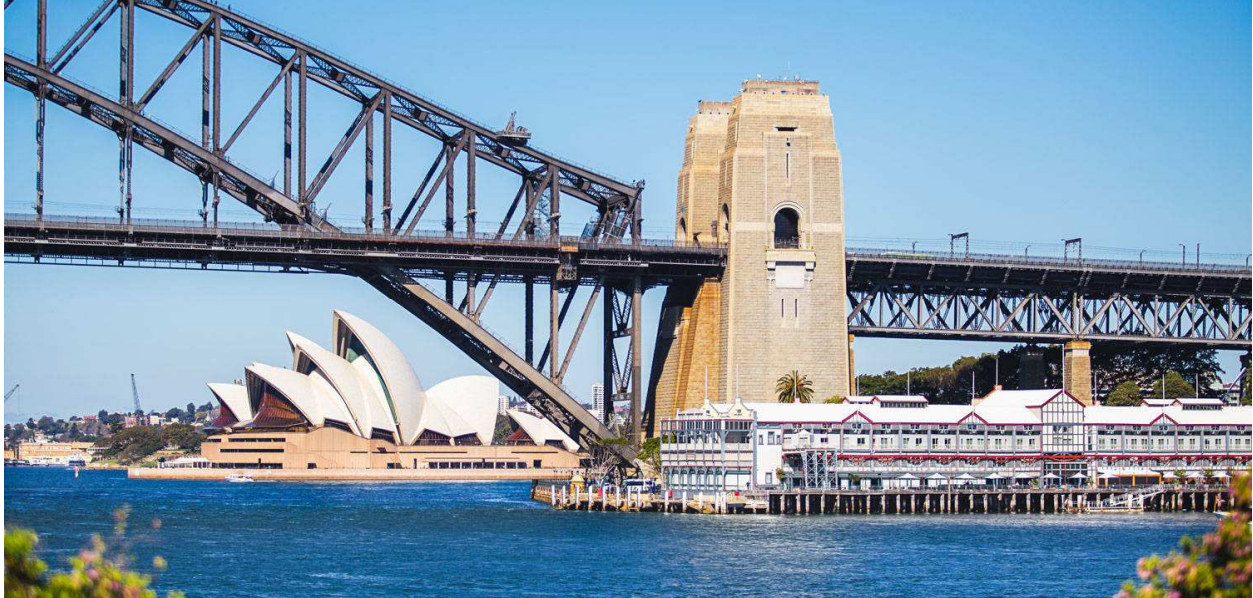
View of Pier One Hotel and other Sydney landmarks.

Mixing Federation-style with contemporary chic, the Pier One Hotel celebrates Australian heritage while providing guests with boutique accommodation near Sydney's most popular districts. Just one of only a few hotels in the heart of The Rocks, guests have easy access to the City's historic dining and entertainment precinct as well as the CBD.