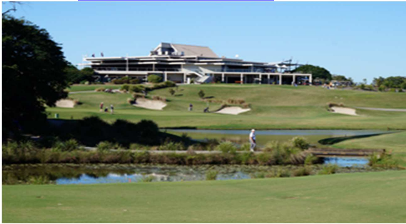
Indooroopilly Golf Club Clubhouse

Breakfast Stamford Plaza Hotel 11.00am Coach to Indooroopilly Golf Club Indooroopilly Golf Club (IGC) Meiers Road, Indooroopilly QLD 4068 Phone: (617) (07) 3721 2121 Email: admin@indooroopillygolf.com.au Website: www.indooroopillygolf.com.au