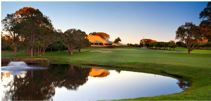
View of Southport Golf Club Clubhouse from across the course

Breakfast Seventy7 Cafe & Bar 11.00am Coach to Southport Golf Club Southport Golf Club Slatyer Avenue, Southport QLD 4215 Phone: (617) (07) 5571 1444 Email: admin@southportgolfclub.com.au Website: www.southportgolfclub.com.au