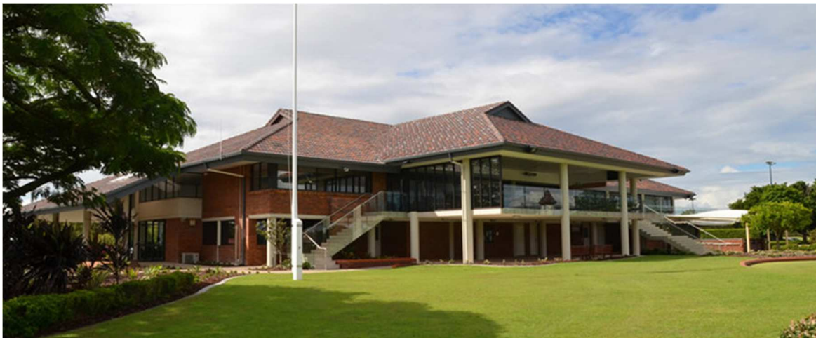
Royal Queensland Golf Club Clubhouse