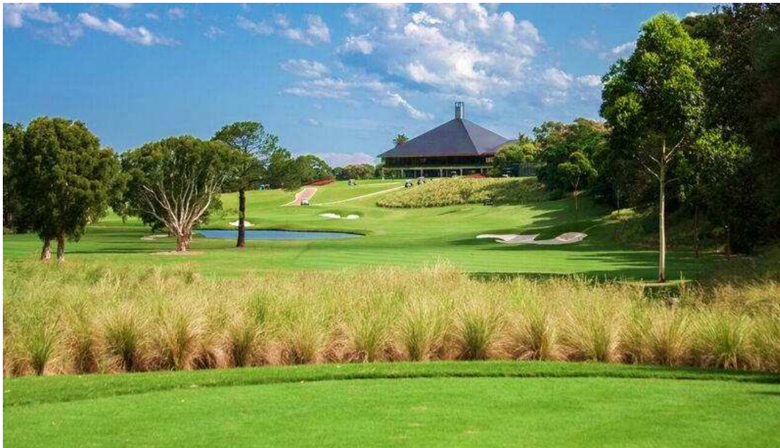
The 9th hole with the green tucked behind the pond and the clubhouse on the hill