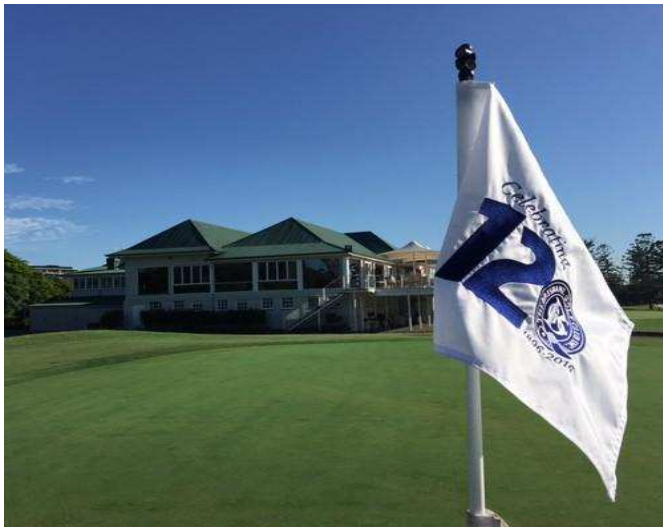
View of Brisbane Golf Club Clubhouse from the 18 th Green

Breakfast Stamford Plaza Hotel 11.00am Coach to Brisbane Golf Club The Brisbane Golf Club (BGC) Tennyson Memorial Avenue, Yeerongpilly QLD 4105 Phone: (617) (07) 3848 1008 Email: mail@brisbanegolfclub.com.au Website: www.brisbanegolfclub.com.au