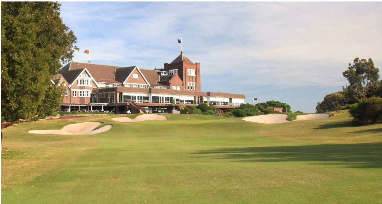
Royal Sydney Golf Club clubhouse with the 18 th green in the foreground

10.30am Board Coach for journey to Royal Sydney Golf Club Royal Sydney Golf Club Kent Road, Rose Bay, NSW 2029 Phone: (612) (02)8362 7000 Email: reception@rsgc.com.au Website: www.rsgc.com.au