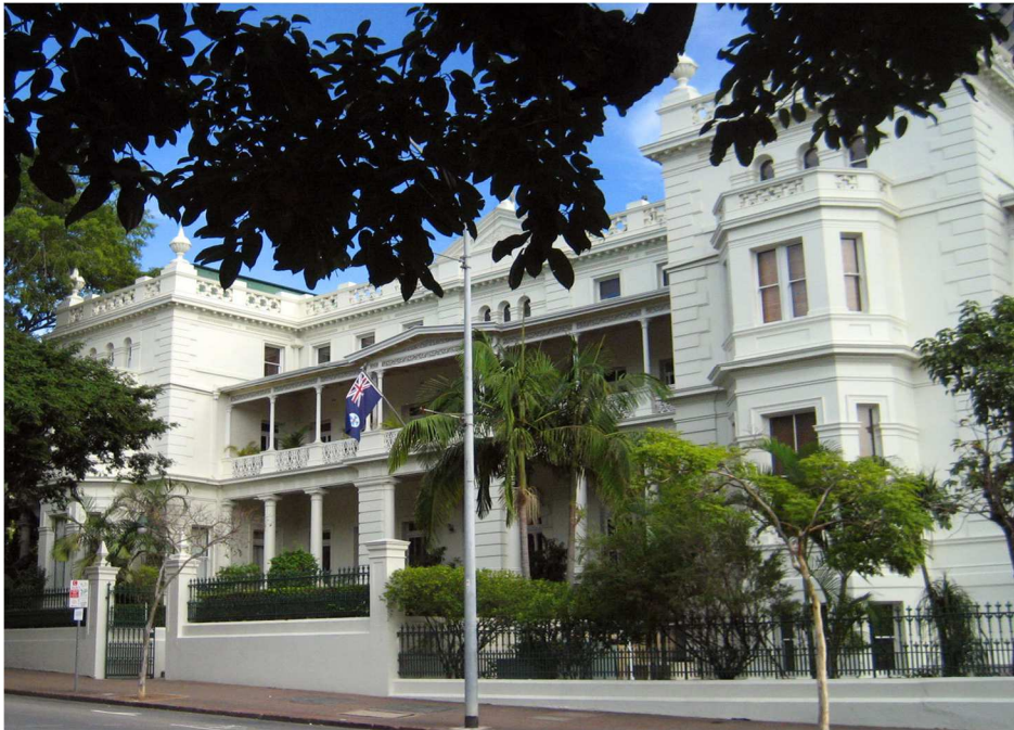
The Queensland Club