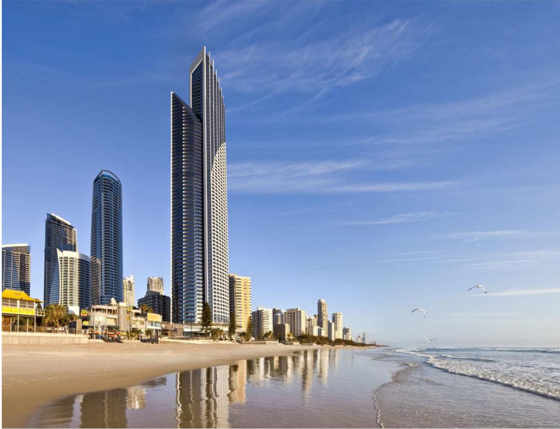
Q1 Tower and Surfers Paradise Beach

Accommodation for the 3 nights is in 1 Bedroom Ocean Spa Apartments and includes daily hot and cold buffet breakfast at Seventy7 Cafe & Bar (including free entry to SkyPoint observation Deck).