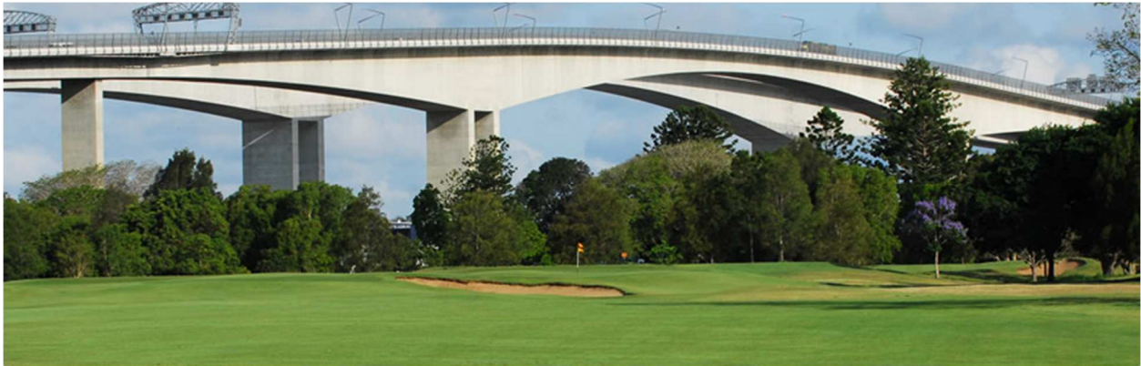
View of the Gateway Bridge across the course

The new course layout was completed in 2007 with the front 9 working around the grounds in a clockwise fashion and the back 9 inside the front 9.